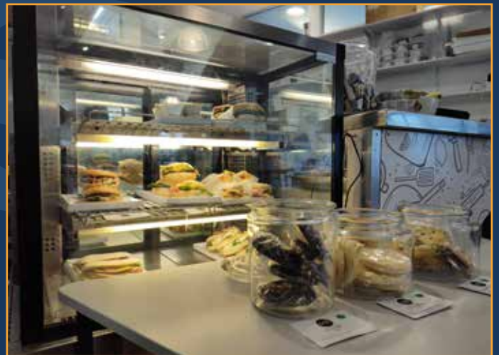
• On-campus Café