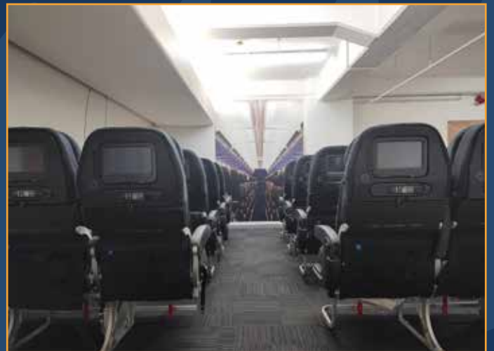
• Aircraft cabin training area