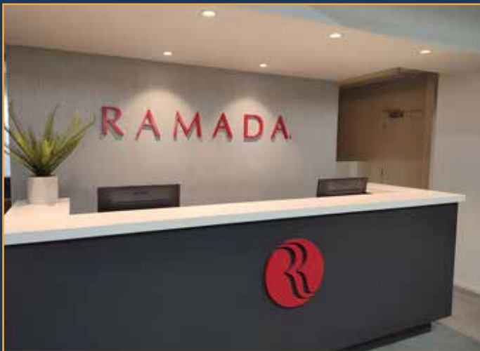
• Hotel training area