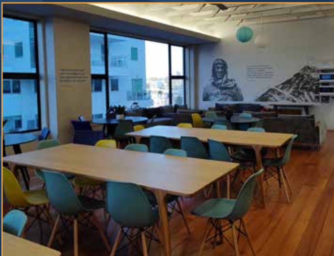
• Outdoor & indoor student common area