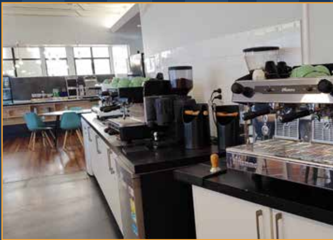
• Barista training area