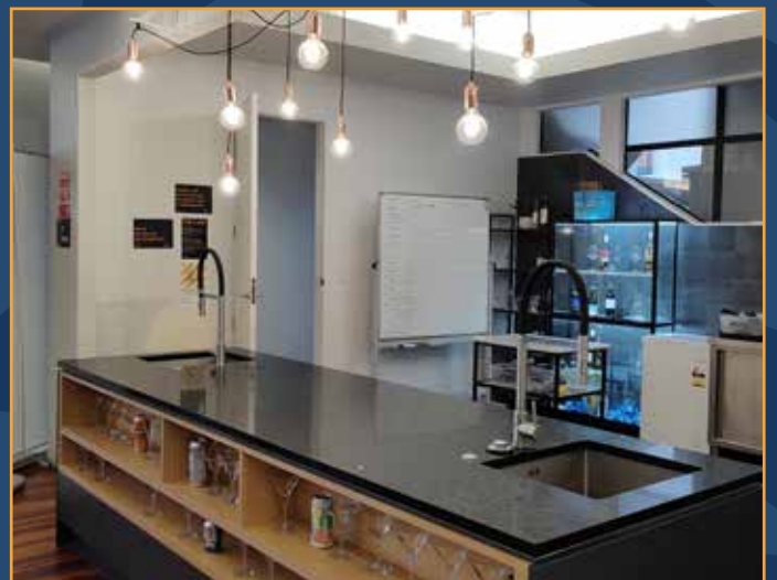
• Bar training area