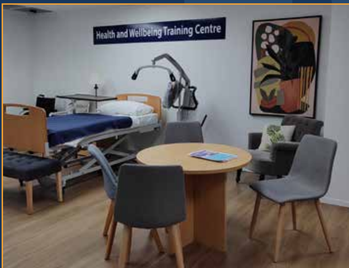
• Health & Wellbeing training centre